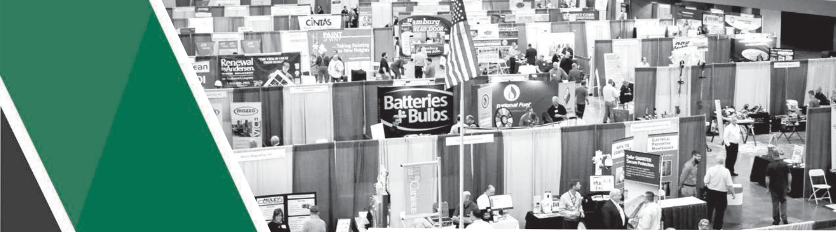
EXHIBIT IN THE 24 TH ANNUAL FACILITIES MANAGEMENT EXPO!

WHERE PROPERTY PERSONNEL & SOLUTION PROVIDERS MEET